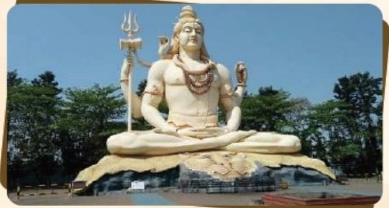
Shiv Temple Kachnar City