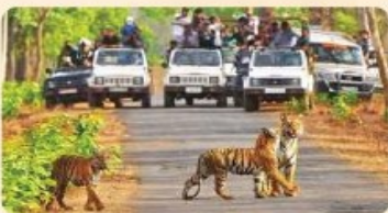
Kanha National Park