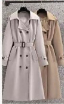
Leather jackets and boots