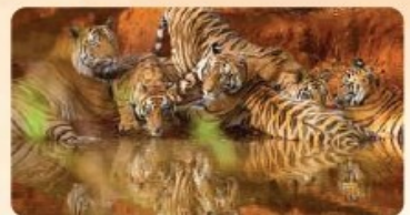
Bandhavgarh National Park