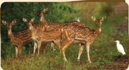
Dumna Nature Reserve