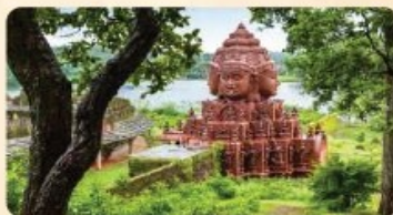
Maa Narmada Origin Amarkantak